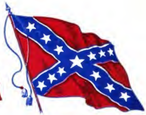
THE BATTLE FLAG.

First flag of the Confederate States, adopted by the Congress at Montgomery, Ala., and raised at the capitol, March 4, 1861, by the granddaughter of President John Tyler.